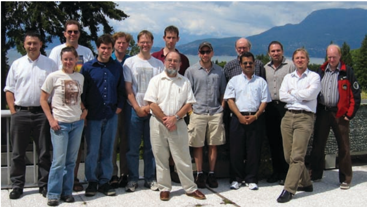
Planetary Sciences workshop participants

The Department of Physics & Astronomy provided additional funds.