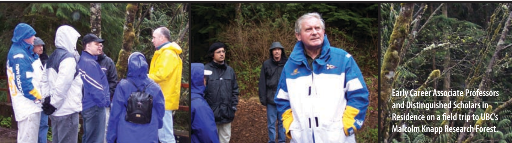
Early Career Associate Professors and Distinguished Scholars in Residence on a field trip to UBC's Malcolm Knapp Research Forest.