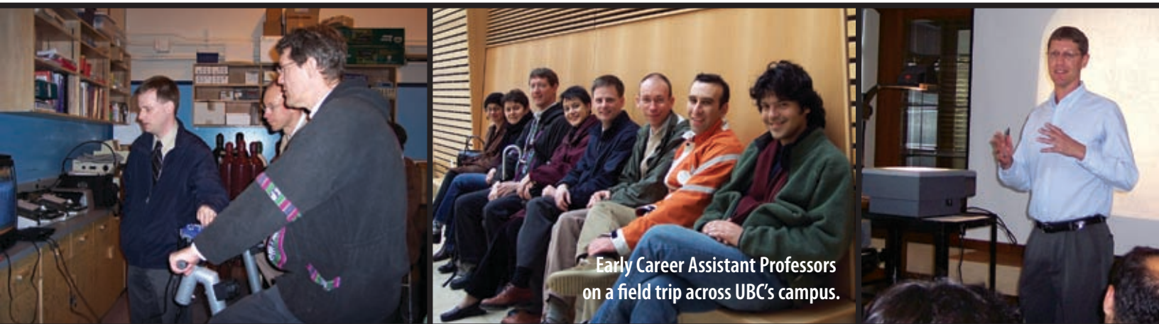
Early Career Assistant Professors on a field trip across UBC's campus.