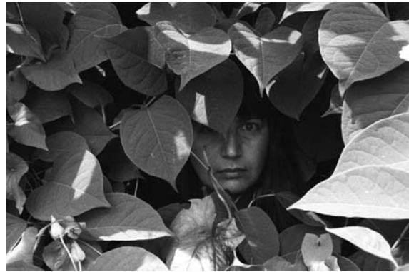
Photographs taken from the presentation for "Romancing the Alien: Invader Species in the Pacific Northwest."